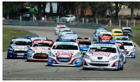
SUPPLIED ON ALL SUPERTURISMO URUGUAYO RACE CARS

CARTEK can now offer drivers an early warning system should their engine cooling system develop a leak, whether it be from a punctured radiator, loose hose or gasket failure before overheating and engine damage occurs.