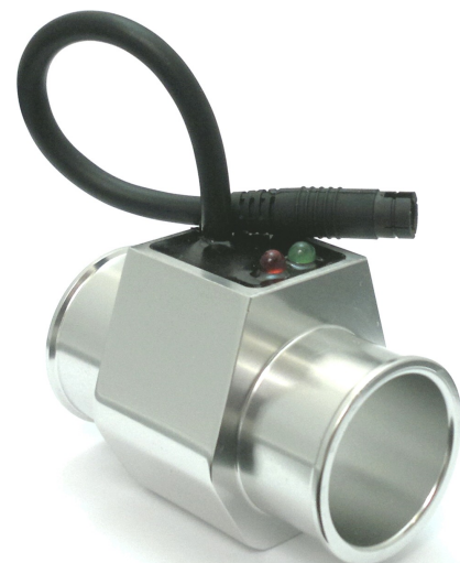
38mm (1 1/2")